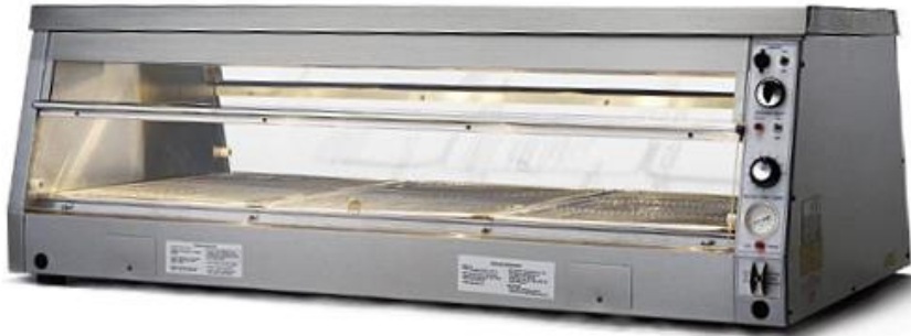
HCW 3 display counter warmer with flip-up doors for pass-through service

Henny Penny display counter warmers are designed for accumulating, holding and displaying hot fresh food for serving or packing at the point of sale in retail foodservice operations.