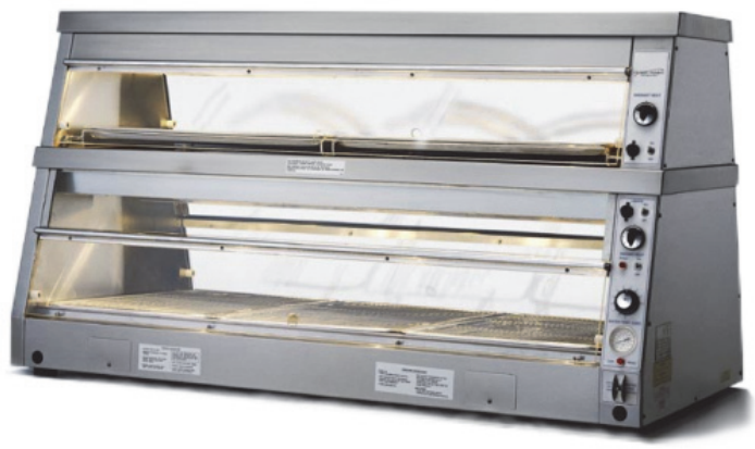
Two-tier display counter warmer, model HCW-5 with flip-up pass-through doors and lower-tier moist heat operation.

MODEL HCW-5 two tier, 5-pan HCW-8 two tier, 8-pan