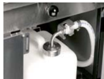
Oil replenished automatically from JIB for multi-well (left) or reservoir for 1-well (right)