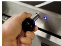
External drain release

Choose from 1, 2, 3, or 4-well, full or split vat configurations. Auto lift models and optional matching profile dump station available.