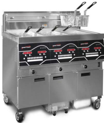
EEG 243 3-well gas open fryer

Henny Penny Evolution Elite® open fryers use innovative technology to extend the useful life of cooking oil and significantly reduce its consumption.